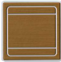
teak over white