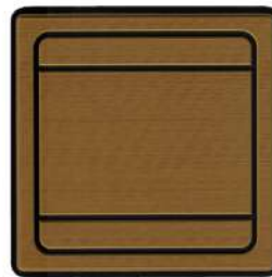
teak over black