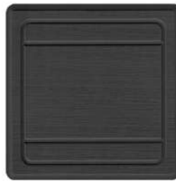
dark grey single color