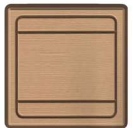
sand over teak