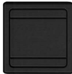
anthracite over black