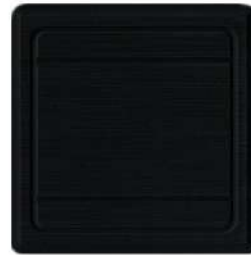
black single color