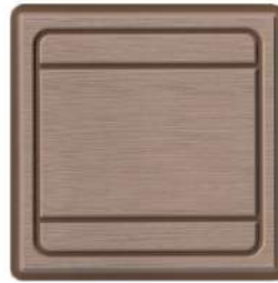
caramel over teak