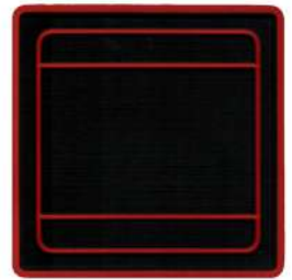
black over red