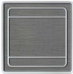
light grey over white