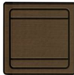
cappuccino over black