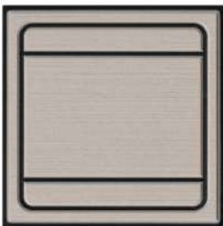
warm grey over black