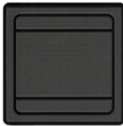
dark grey over black