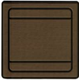
cappuccino over black