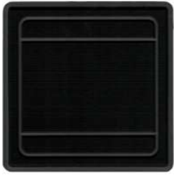
black over dark grey