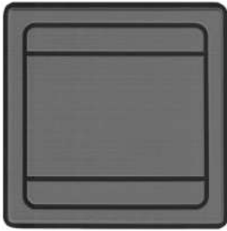
light grey over black