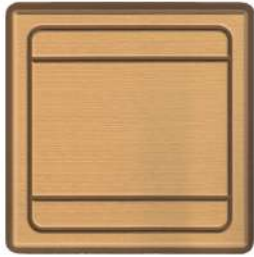
sand over teak