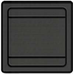
dark grey over black