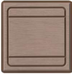
caramel over teak