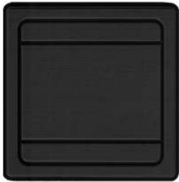
anthracite over black