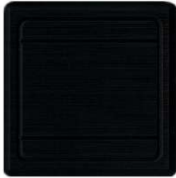
black single color