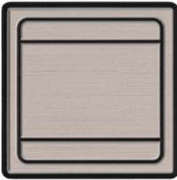
warm grey over black