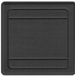
dark grey single color