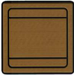
teak over black